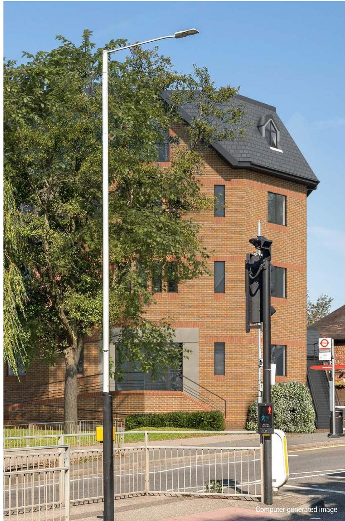
View along Cowley Road