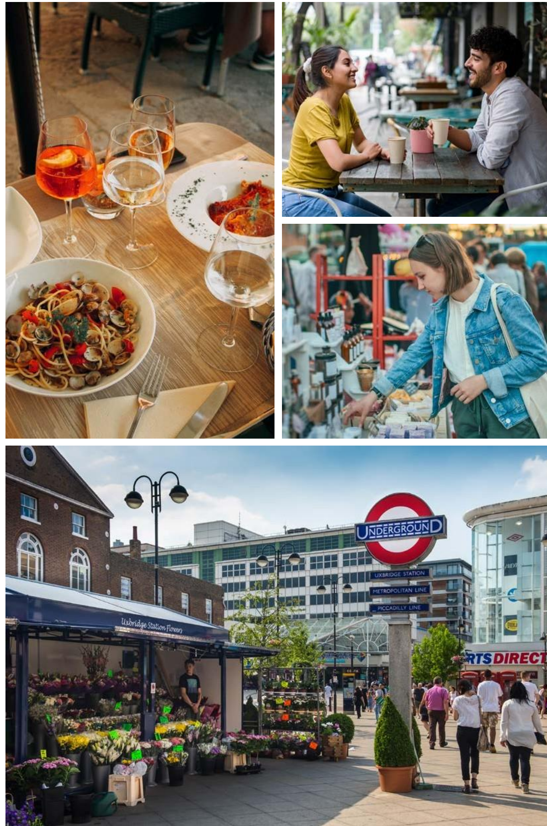
ABOVE Uxbridge Underground station